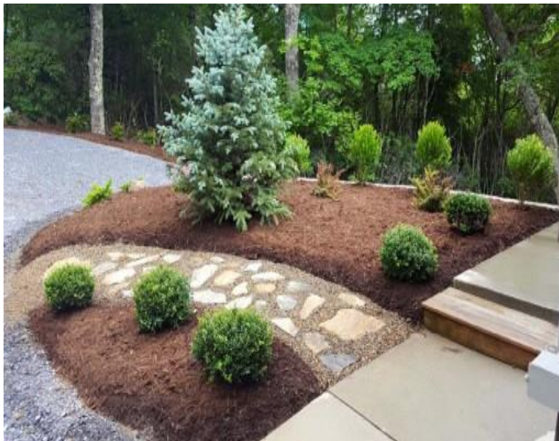
Beautify flagstone walkways with decorative stone or pavers