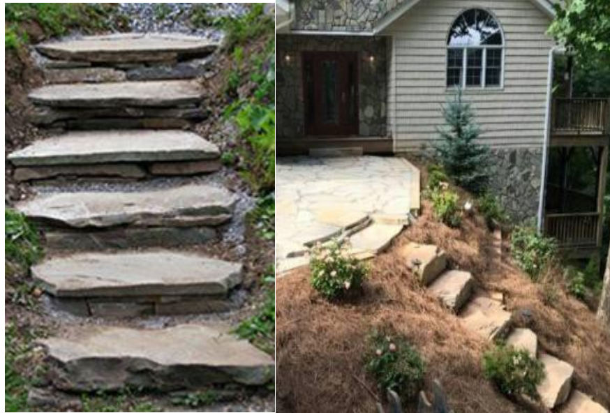
Using natural stone as steps going down slopes

contractor in this area for installing retaining walls and other structures that involve natural stone, block, pavers, and treated wood. The use of these materials can also minimize mowing areas.